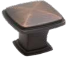
Milan 1 Knob 1091-DBAC 1 3 / 16 " Square Available in AB, AEM, BNBDL, DACM, DBAC, PC, SN