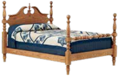
525 CANNONBALL BED -See Page 44