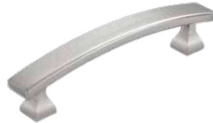
Hadly Pull 449-96 4 3 / 4 " L

Available in BNBDL, DBAC, DMAC, MB, PC, SIM, SBZ, SN