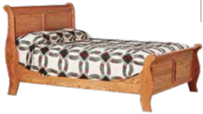
511 CAPTAIN SLEIGH BED -See Page 44