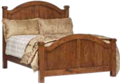
518 CANYON CREEK ARCH PANEL BED -See Page 32