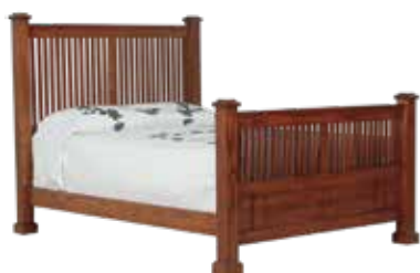
506 MISSION BED -See Page 46