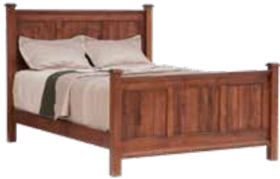
88-504 YORKTOWNE PANEL BED

-with standard side rails -53" h (head) 33" (foot)