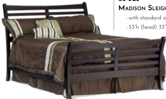
88-523 MADISON SLEIGH BED -with standard side rails -53" h (head) 33" h (foot)