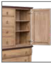
88-7917 DOOR & DRAWER ARMOIRE -43½" w x 73" h x 20" d -2 adjustable shelves