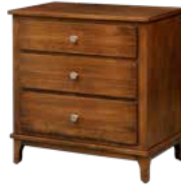
88-7804 BEDSIDE CHEST -30" w x 30" h x 18" d