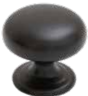
Florence Knob 2980 - MB 1 1 / 4 " Diameter Available in BNBDL, DBAC, MB, ORB, PC, SBZ, SN