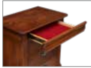
Hidden Jewelry Drawer in Night Stands, Lingerie Chest, Chest of Drawers, and Dressers