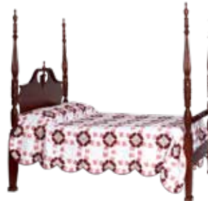
532 RICE POST BED -See Page 44