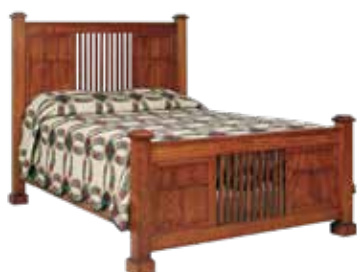
508 MISSION BED -See Page 46