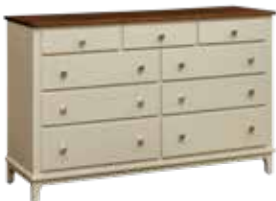
88-7826-60 TRIPLE DRESSER -60" w x 36" h x 20" d