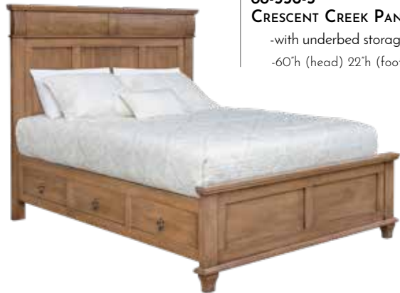
88-536-3 CRESCENT CREEK PANEL BED -with underbed storage -60" h (head) 22" h (foot)