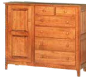
84-116 GENT'S CHEST -56" w x 47" h x 20" d