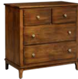
88-7822 Single Dresser -37" w x 36" h x 20" d