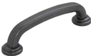
Bremen 1 Pull 527 DACM 4 5 / 16 " L

Available in BNBDL, DBAC, MB, PC, SBZ, SN