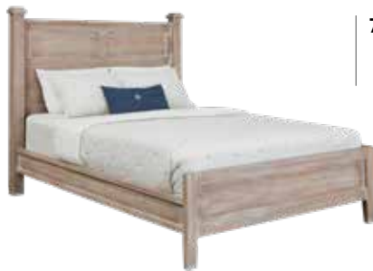
72-531 PANEL BED -60"h (head) - 21"h (foot)