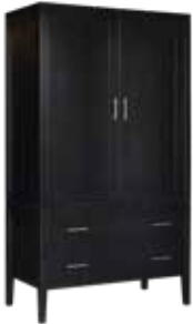
88-1418 ARMOIRE -42" w x 77" h x 25" d