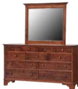
88-926 TRIPLE DRESSER 88-009 LANDSCAPE MIRROR

-57" w x 38" h x 19" d -37" w x 49" h x 2" d