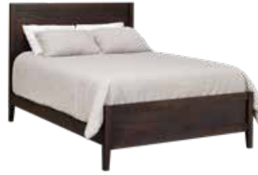
527 ALBANY PANEL BED -See Page 28