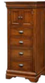
84-713 LINGERIE CHEST -26" w x 56" h x 20" d