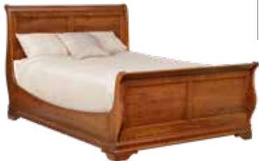
84-541 CALAIS SLEIGH BED -with high footboard -50" h (head) 30" h (foot)