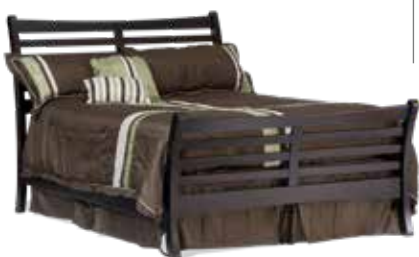
523 MADISON AVE SLEIGH BED -See Page 24