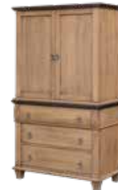
88-7918 DOOR ARMOIRE -43½" w x 73" h x 20" d -2 adjustable shelves