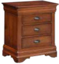
84-704 3-DRAWER NIGHT STAND -26" w x 29" h x 17" d