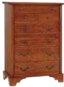
84-7414 CHEST OF DRAWERS -39" w x 54" h x 20" d