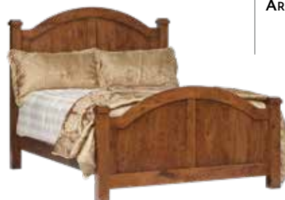
84-518 ARCH PANEL BED -61"h (head) 38"h (foot)