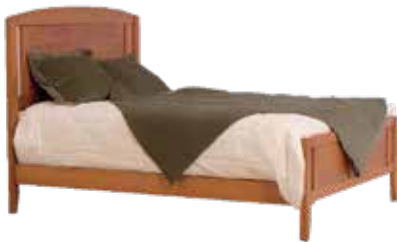
552 TRADEWIND PANEL BED -See Page 26