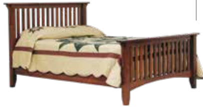
512 MISSION BED -See Page 46