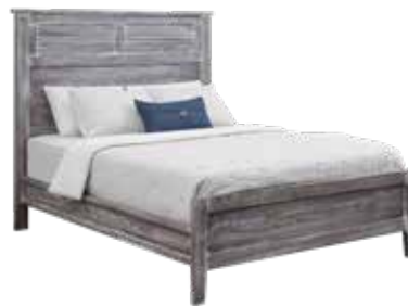
72-533 LOUVER PANEL BED -61"h (head) - 21"h (foot)