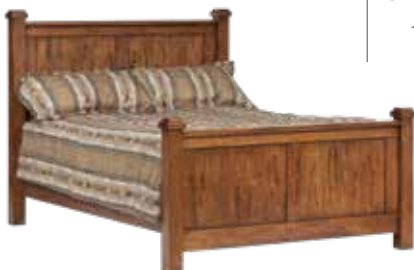
84-517 CANYON CREEK PANEL BED -56"h (head) 32"h (foot)