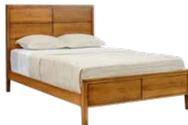
535 Estelle Panel BED -See Page 18