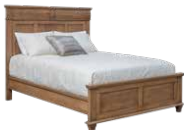
536 CRESCENT CREEK BED -See Page 34