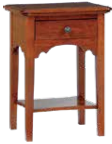
84-7401 OPEN NIGHT TABLE -22" w x 29" h x 17" d