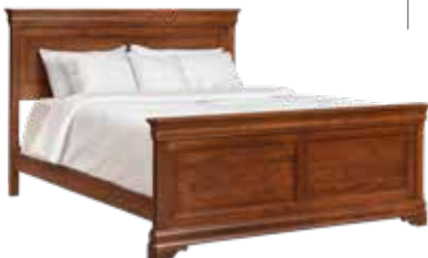
84-542 CHATEAU PANEL BED -54" h (head) 31" h (foot)