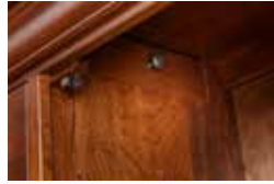
Hidden Drawer in Door and Drawer Chest and Chifferobe