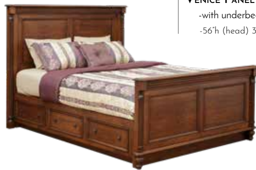
84-544-3 VENICE PANEL BED -with underbed storage -56" h (head) 31" h (foot)