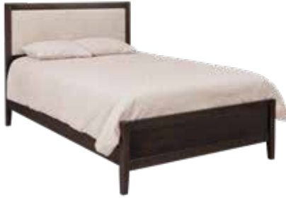
527U ALBANY UPHOLSTERED PANEL BED -See Page 28