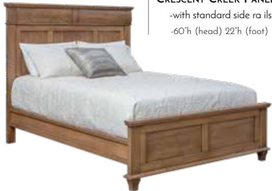
88-536 CRESCENT CREEK PANEL BED -with standard side rails -60" h (head) 22" h (foot)