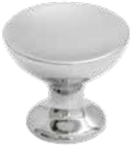
Rae Knob 667L PC 1 3 / 16 " Diameter Available in BNBDL, DBAC, NI, PC, SN