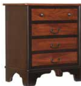
88-904 NIGHT TABLE

-27" w x 29" h x 16" d -shown in Elm Tops and Drawer Fronts