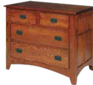
72-820 SINGLE DRESSER -42" w x 34" h x 25" d