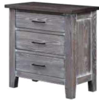
72-7705 BEDSIDE CHEST -32" w x 32" h x 17" d