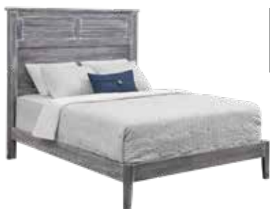
72-533-2 LOUVER PANEL BED w/ LOW RAIL FB -61"h (head) - 14"h (foot)