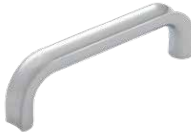
Rae Pull 667-96 PC 4 3 / 16 " L Available in BNBDL, DBAC, NI, PC, SN