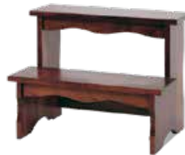
84-208 BED STEPS