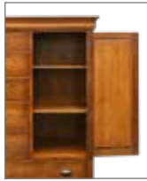
84-717-64 64" DOOR & DRAWER CHEST -44" w x 64" h x 20" d