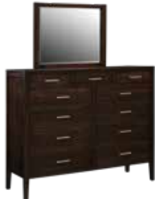
88-1425-58 DOUBLE HIGH DRESSER -58" w x 48" h x 15" d