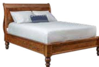
507 CANYON CREEK LOW FB BED -See Page 32