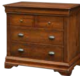
84-722 SINGLE DRESSER -40" w x 36" h x 22" d