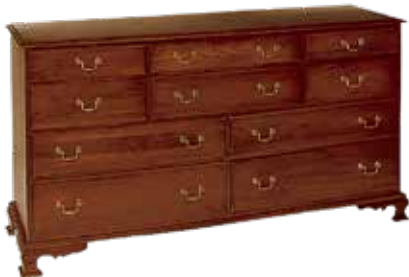
84-226 TRIPLE DRESSER