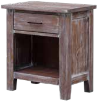
72-7701 OPEN NIGHT TABLE -28" w x 30" h x 17" d