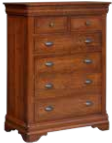
84-714 CHEST OF DRAWERS -39" w x 52" h x 20" d