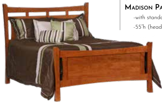
84-524 MADISON PANEL BED -with standard side rails -55" h (head) 31" h (foot)