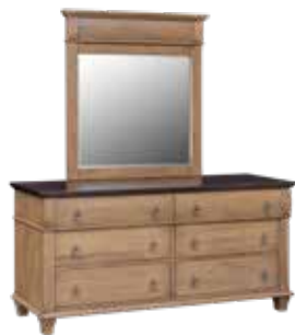
88-7924-72 LOW TRIPLE DRESSER -72" w x 33" h x 20" d -also available 7924-60 Low Triple Dresser 60" w x 33" h x 20" d