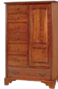
84-7416 DRAWER AND DOOR CHEST -44" w x 68" h x 20" d