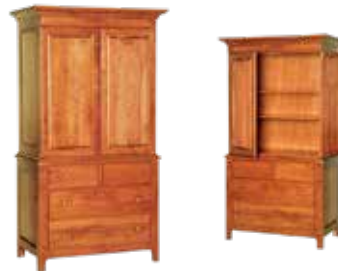
84-118 ARMOIRE -44" w x 80" h x 26" d