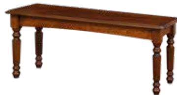
84-7509 VENICE BENCH -46" w x 17" h x 18" d