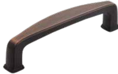
Milan 1 Pull 1092-DBAC 4 1 / 4 " L Available in AB, AEM, BNBDL, DACM, DBAC, PC, SN