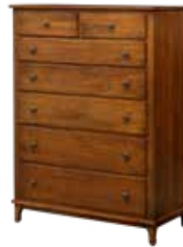
88-7815 MASTER CHEST OF DRAWERS -42" w x 57" h x 20" d