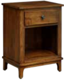
88-7801-21 OPEN NIGHT STAND -21" w x 29" h x 16" d -also available 7801-26 Open Night Stand -26" w x 29" h x 16" d