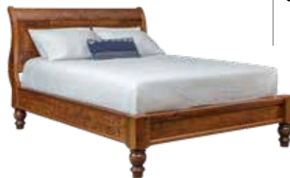
84-507 CANYON CREEK SLEIGH BED -Low footboard -56"h (head) 20"h (foot)