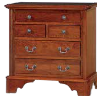
84-7420 SINGLE DRESSER -39" w x 36" h x 24" d