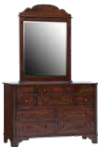
88-924 DOUBLE DRESSER 88-0011 ARCH TOP MIRROR

-57" w x 38" h x 19" d -37" w x 49" h x 2" d