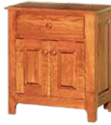
84-107 DOOR/DRAWER NIGHT STAND -26" w x 28" h x 16" d