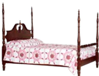
84-530 PEDIMENT BED -75" h (head) 63" (foot)