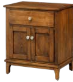
88-7802-26 DOOR/DRAWER NIGHT STAND -26" w x 29" h x 16" d -also available 7802-21 Door/Drawer Night Stand -21" w x 29" h x 16" d