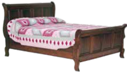
84-509 COLONIAL SLEIGH BED -49" h (head) 30" (foot)