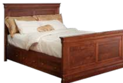
84-542-3 CHATEAU PANEL BED -with underbed storage -54" h (head) 31" h (foot)