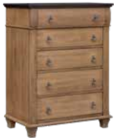
88-7914 CHEST OF DRAWERS -39½" w x 50" h x 20" d