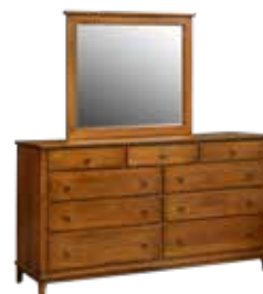
88-7826-70 TRIPLE DRESSER -70" w x 36" h x 20" d 88-00830 LANDSCAPE MIRROR -42" w x 37" h x 2" d