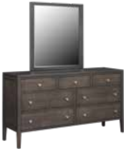
88-1424-65 DOUBLE DRESSER -65" w x 36" h x 19" d