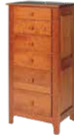
84-113 LINGERIE CHEST -26" w x 52" h x 20" d