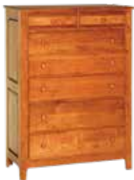
84-119 MASTER CHEST -42" w x 56" h x 20" d