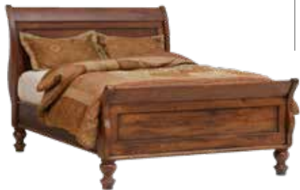
501 CANYON CREEK SLEIGH BED -See Page 32