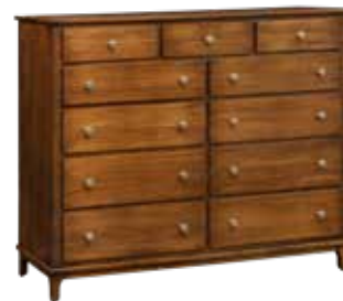
88-7825 LADY'S DRESSER -60" w x 51" h x 20" d