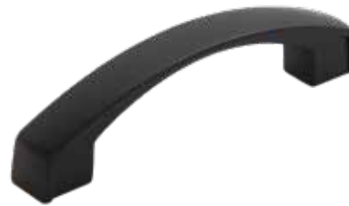
Merrick Pull 549-96 4 3 / 16 " L

Available in BNBDL, DBAC, MB, PC, SBZ, SN