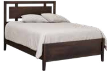
528 MANHATTEN PANEL BED -See Page 28