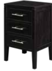
88-1402 NIGHT STAND -22" w x 29" h x 16" d