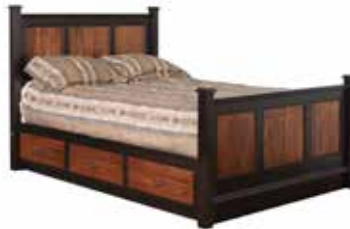
88-504-3 YORKTOWNE PANEL BED

-with standard side rails -53" h (head) 33" (foot)