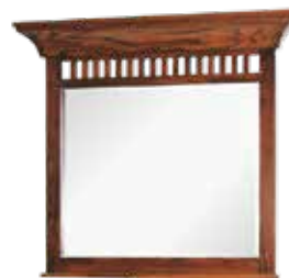
72-032 MIRROR -48" w x 44" h x 5" d