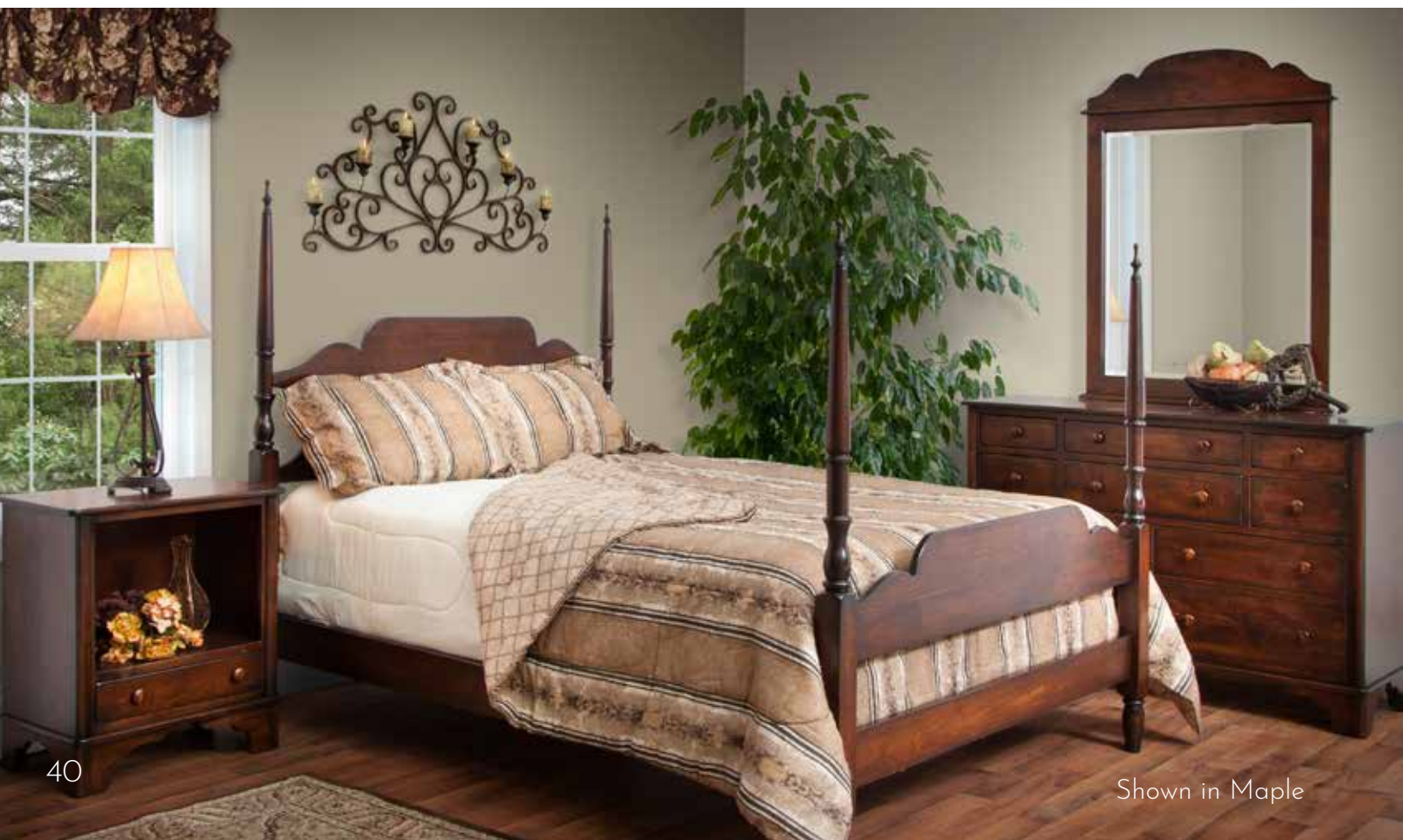
Shown in Maple