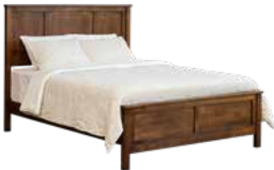
555 WESTLAKE PANEL BED -See Page 26