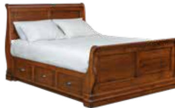
84-541-3 CALAIS SLEIGH BED -with high footboard and underbed storage -50" h (head) 30" h (foot)