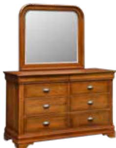
84-724 DOUBLE DRESSER -60" w x 36" h x 20" d