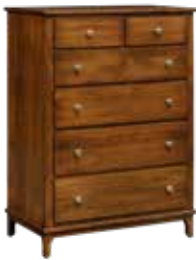
88-7814 CHEST OF DRAWERS -37" w x 51" h x 20" d