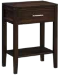
88-1401 NIGHT STAND -22" w x 31" h x 16" d