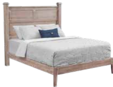
72-531-2 PANEL BED w/ LOW RAIL FB -60"h (head) - 14"h (foot)