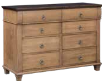
88-7928-60 HIGH DOUBLE DRESSER -60" w x 44" h x 20" d -also available 7928-72 High Triple Dresser -72" w x 44" h x 20" d