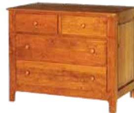
84-120 SINGLE DRESSER -42" w x 34" h x 24" d