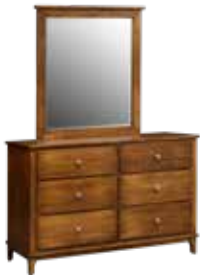
88-7824 DOUBLE DRESSER -54" w x 36" h x 20" d 88-00829 VERTICAL MIRROR -36" w x 41" h x 2" d