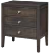
88-1403 BEDSIDE CHEST -26" w x 29" h x 16" d