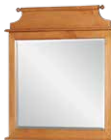
88-0010 SCROLL MIRROR