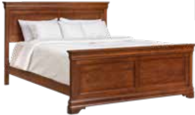
542 CHATEAU BED -See Page 30