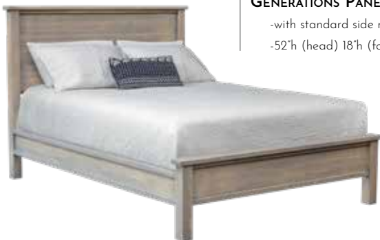
88-502 GENERATIONS PANEL BED -with standard side rails -52" h (head) 18" h (foot)