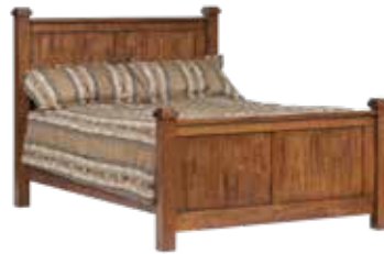
517 CANYON CREEK PANEL BED -See Page 32