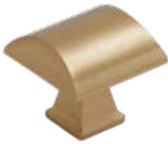
Roman Knob 944 SBZ 1 1 / 4 " L

Available in BNBDL, DBAC, MB, NI, PC, SBZ, SN