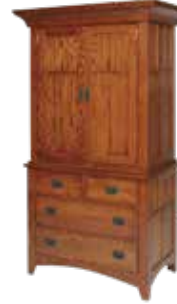
72-817 ARMOIRE -47" w x 81" h x 27" d