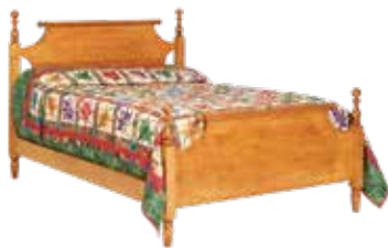
88-505 SCROLL BED

-with underbed storage -53" h (head) 33" h (foot) -shown in Elm Panels and Drawer Fronts