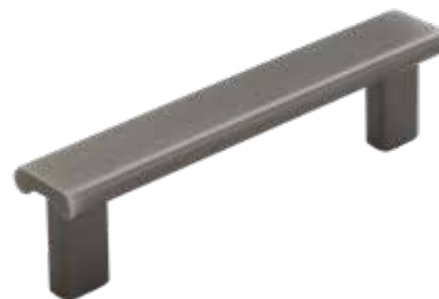
Park Pull 183-96 BNBDL 4 1 / 2 " L

Available in BNBDL, DACM, DBAC, DMAC, MB, PC, SBZ, SN