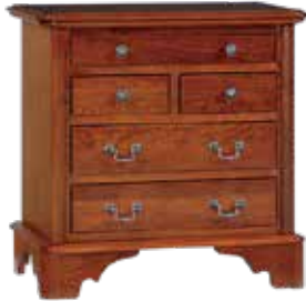
84-7405 BEDSIDE CHEST -32" w x 31" h x 17" d