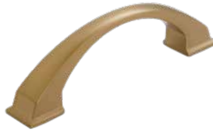
Roman Pull 944-96 SBZ 4 13 / 16 " L

Available in BNBDL, DBAC, MB, NI, PC, SBZ, SN