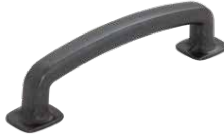
Belcastel 1 Pull MO 6373 DACM 4 5 / 8 " L Available in BNBDL, DACM, DBAC, DMAC, PC, SBZ, SN