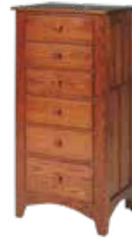
72-813 LINGERIE CHEST -26" w x 51" h x 20" d