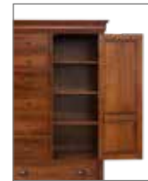
84-717 DOOR & DRAWER CHEST -44" w x 71" h x 20" d