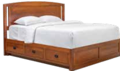
552-4 TRADEWIND PANEL BED -With Drawer Storage - See Page 26