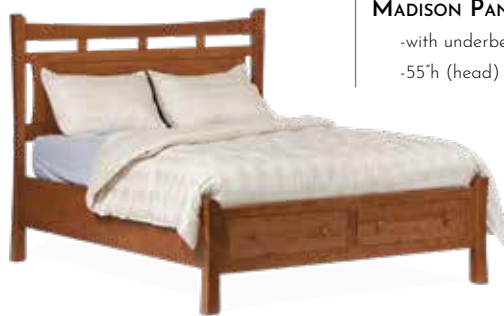
84-524-5 MADISON PANEL BED -with underbed storage footboard -55" h (head) 21" h (foot)