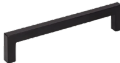
Stanton Bar Pull 625-128-MB 5 3 / 8 " L Available in SN, MB, SBZP PC