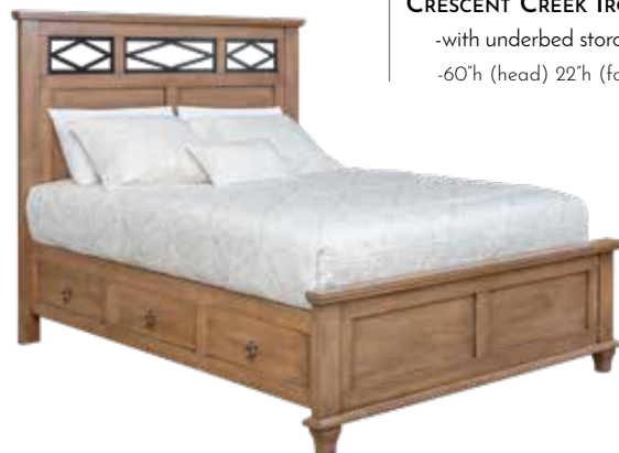
88-537-3 CRESCENT CREEK IRON BED -with underbed storage -60" h (head) 22" h (foot)