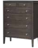
88-1414-36 CHEST OF DRAWERS -36" w x 48" h x 19" d -also available 1414-42 Wide Chest of Drawers -42" w x 48" h x 19" d