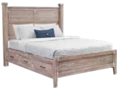
72-531-3 PANEL BED w/ UNDERBED STORAGE -60"h (head) - 21"h (foot)