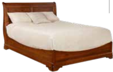
84-540 CALAIS SLEIGH BED -50" h (head) 16" h (foot)