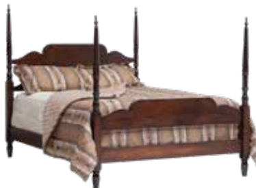
88-506 ARCH TOP BED