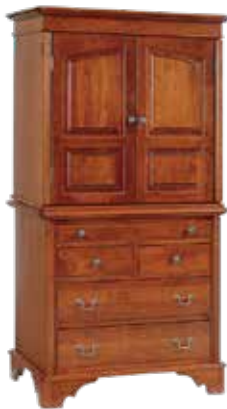
84-7418 ARMOIRE -39" w x 74" h x 24" d