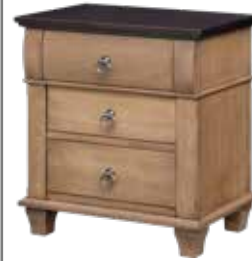
88-7905 BEDSIDE CHEST -32" w x 32" h x 17" d