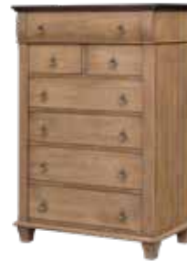
88-7915 MASTER CHEST OF DRAWERS -41" w x 58" h x 20" d