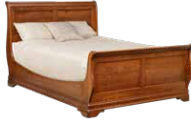
541 CALAIS SLEIGH BED -See Page 30