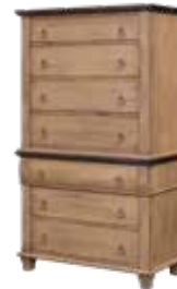
88-7916 DRAWER ARMOIRE -43½" w x 73" h x 20" d