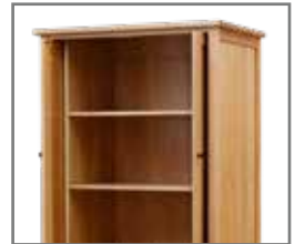
84-287 LOW CHEST