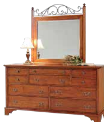
84-7426 TRIPLE DRESSER -75" w x 38" h x 20" d 84-0062 LANDSCAPE IRON MIRROR -46" w x 46" h x 3" d