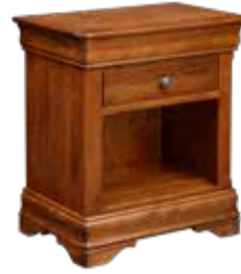
84-702 NIGHT STAND -26" w x 29" h x 17" d