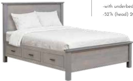
88-502-3 GENERATIONS PANEL BED -with underbed storage -52" h (head) 20" h (foot)