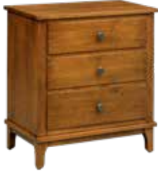
88-7803-26 3-DRAWER NIGHT STAND -26" w x 29" h x 16" d -also available 7803-21 3-Drawer Night Stand 21" w x 29" h x 16" d