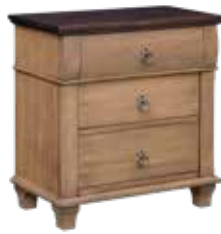
88-7903 3-DWR. NIGHT STAND -28" w x 30" h x 17" d