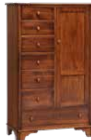
88-916 DRAWER AND DOOR CHEST

-41" w x 54" h x 19" d -shown in Elm Tops and Drawer Fronts