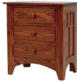
72-803 NIGHT TABLE -24" w x 27" h x 15" d