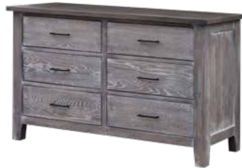
72-7724 DOUBLE DRESSER -60" w x 37" h x 20" d