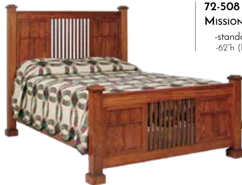
72-508 MISSION BED -standard side rails -62" h (head) 32" (foot)