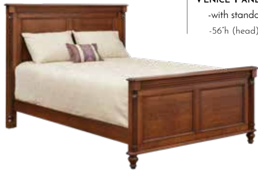
84-544 VENICE PANEL BED -with standard side rails -56" h (head) 31" h (foot)

- all Venice beds available in Twin, Full, Queen, King and Cal. King