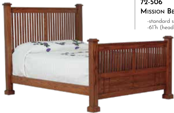
72-506 MISSION BED -standard side rails -61" h (head) 39" (foot)