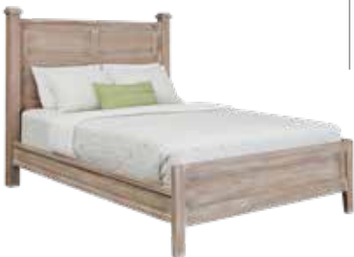
531 MANOR PANEL BED -See Page 20