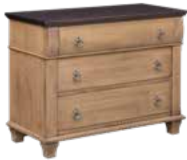
88-7922 SINGLE DRESSER -43½" w x 33" h x 20" d