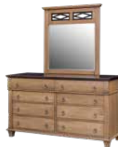
88-7926-72 TRIPLE DRESSER -72" w x 39" h x 20" d -also available 7926-60 Triple Dresser -60" w x 33" h x 20" d