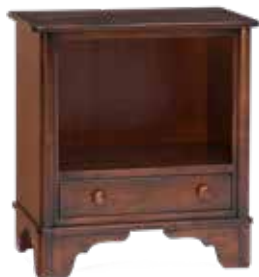
88-901 LIBRARY NIGHT TABLE