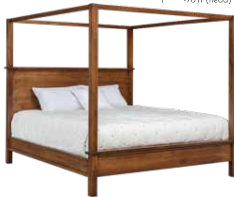
88-503 GENERATIONS CANOPY BED -with standard side rails -78" h (head) 78" h (foot)