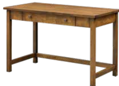
88-280 GENERATIONS DESK -48" w x 30" h x 24" d