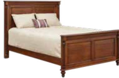
544 VENICE BED -See Page 36