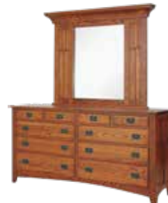
72-826 TRIPLE DRESSER -78" w x 37" h x 20" d