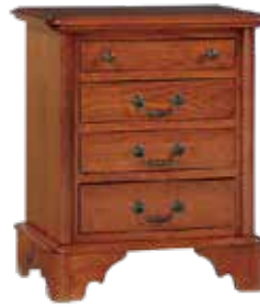
84-7404 NIGHT TABLE -26" w x 30" h x 17" d