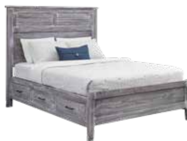
72-533-3 LOUVER PANEL BED w/ UNDERBED STORAGE -61"h (head) - 21"h (foot)