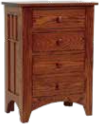
72-804 NIGHT TABLE -24" w x 34" h x 15" d