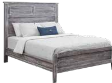
533 Manor Louver Panel BED -See Page 20