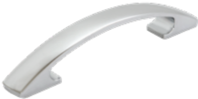
Strickland Pull 771-96 PC 5 3 / 16 " L