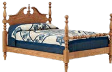
72-525 CANNONBALL BED -57" h (head) 47" (foot)