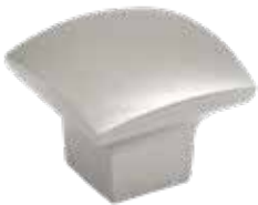
Sonoma Knob 431 SN 1 3 / 16 " Square Available in BNBDL, DBAC, MB, PC, SN