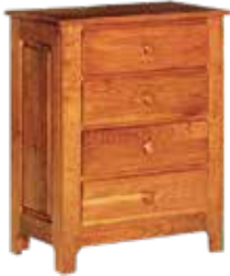
84-108 BEDSIDE CHEST -26" w x 32" h x 16" d