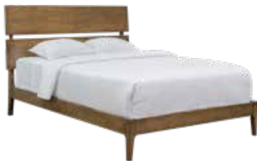
534-2 ESTELLE SLEIGH BED -See Page 18