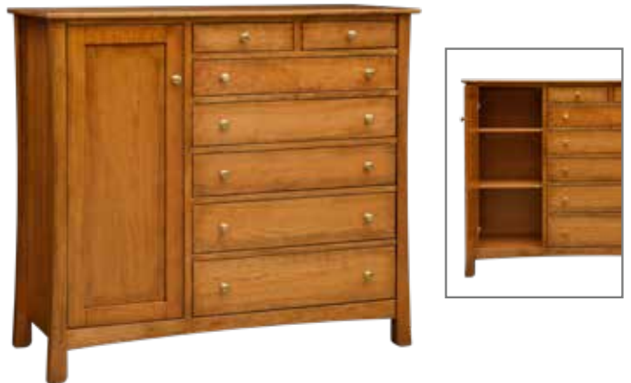
84-1216 GENT'S CHEST -60" w x 20" d x 53" h