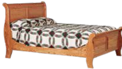
72-511 COLONIAL SLEIGH BED -54" h (head) 30" (foot)