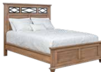
537 CRESCENT CREEK IRON BED -See Page 34