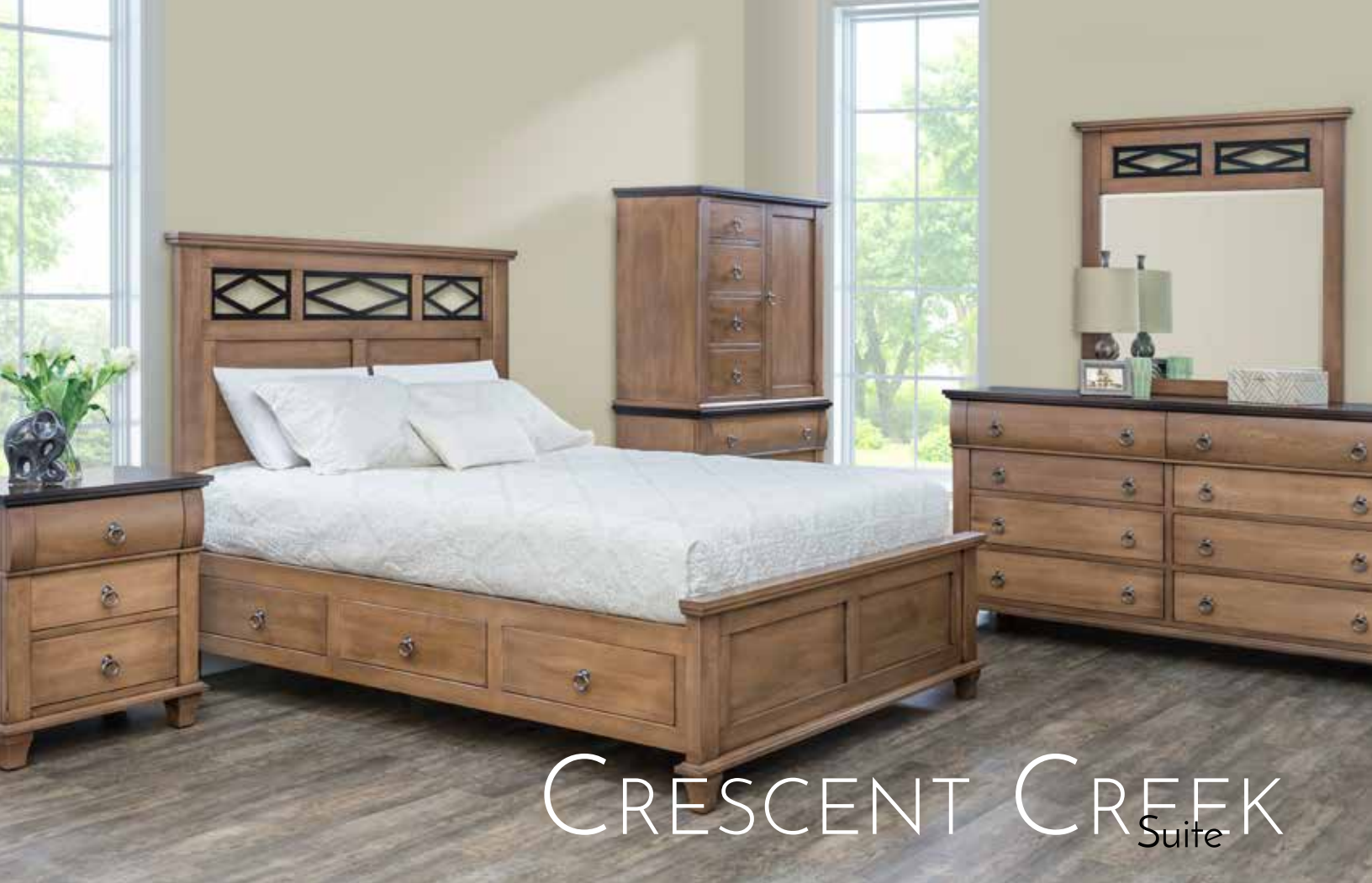
CRESCENT CREEK Suite