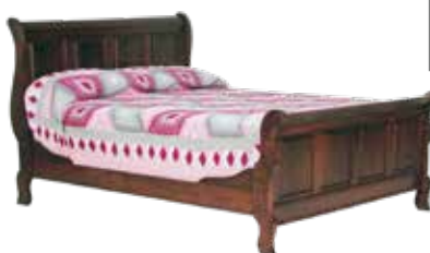
509 COLONIAL SLEIGH BED -See Page 44