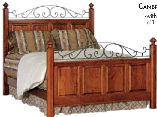
84-546 CAMBRIDGE IRON BED -with standard side rails -61" h (head) 41" (foot)