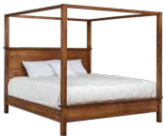
503 GENERATION CANOPY BED -See Page 22