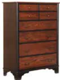
88-914 CHEST OF DRAWERS

-27" w x 29" h x 16" d -shown in Elm Tops and Drawer Fronts