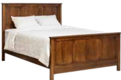
557 WESTLAKE PANEL BED -See Page 26