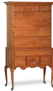
84-218 FLAT TOP HIGH BOY