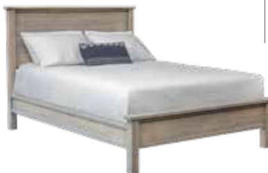
502 GENERATION PANEL BED -See Page 22