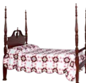
84-532 Rice Bed -87" h (head) 87" (foot)