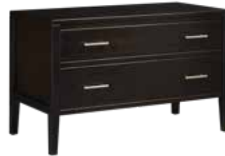
88-1420 LOW CHEST -42" w x 27" h x 25" d