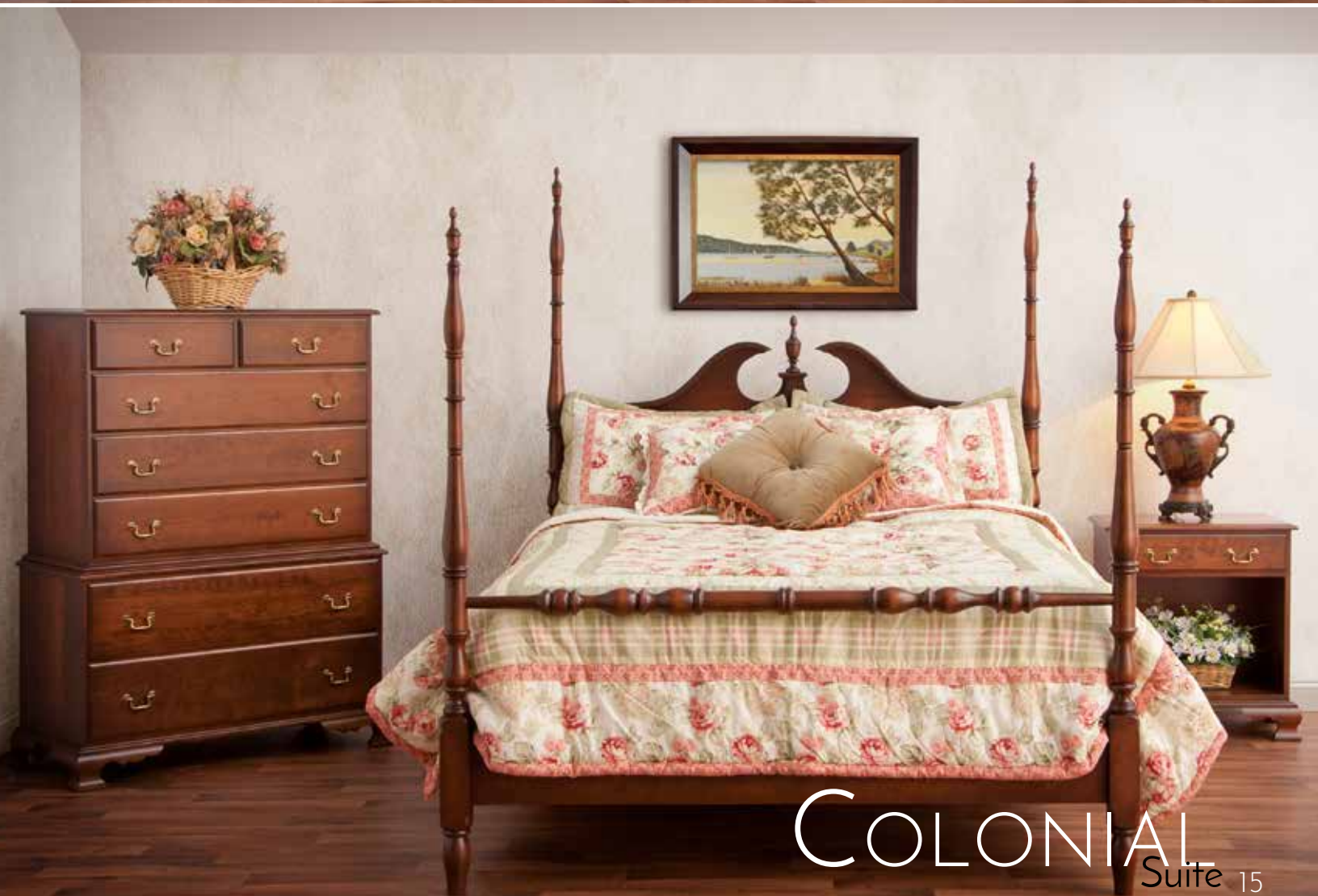
COLONIAL Suite 15