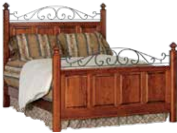
546 CAMBRIDGE IRON BED -See Page 42