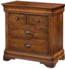
84-705 BEDSIDE CHEST -32" w x 32" h x 17" d