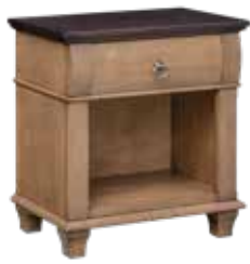
88-7901 OPEN NIGHT STAND -28" w x 30" h x 17" d