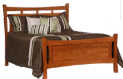
524 MADISON AVE PANEL BED -See Page 24