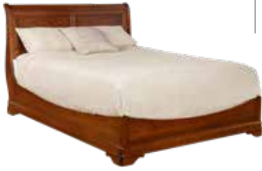
540 CALAIS BED -See Page 30