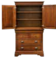
84-718 ARMOIRE -40" w x 72" h x 22" d