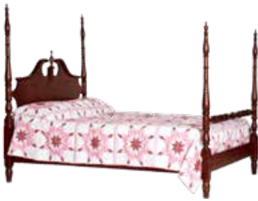
530 PEDIMENT BED -See Page 44