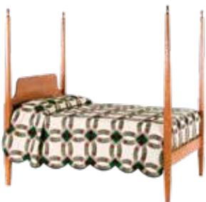
520 SHAKER PENCIL POST BED -See Page 38