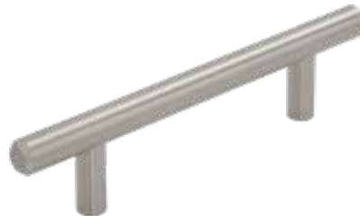
Albany Bar Pull 156 SN 6 1 / 8 " L Available in PC, SBZ, SN