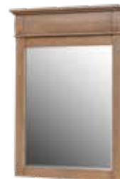
88-00720 VERTICAL MIRROR -38" w x 49" h x 2½" d -also available 00719 Low Mirror -48" w x 38" h x 2½" d