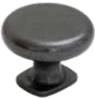
Belcastel 1 Knob MO-6303 DACM 1 3 / 8 " Diameter Available in BNBDL, DACM, DBAC, DMAC, PC, SBZ, SN