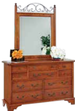
84-7424 DOUBLE DRESSER -60" w x 38" h x 20" d 84-0061 VERTICAL IRON MIRROR -41" w x 51" h x 3" d