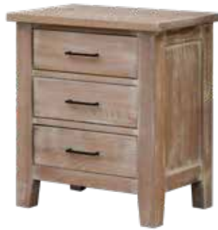
72-7703 NIGHT TABLE -28" w x 30" h x 17" d