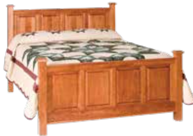
519 SHAKER PANEL BED -See Page 38