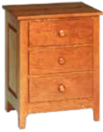
84-106 NIGHT TABLE -21" w x 26" h x 16" d