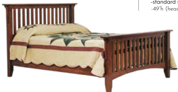
84-512 MISSION BED -standard side rails -49" h (head) 31" (foot)