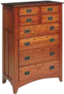
72-814 CHEST OF DRAWERS -38" w x 54" h x 15" d