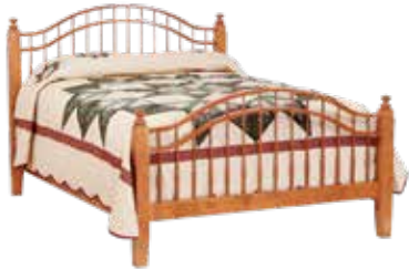
514 WINDSOR BED -See Page 38