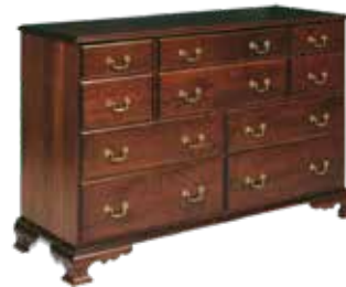
84-224 DOUBLE DRESSER