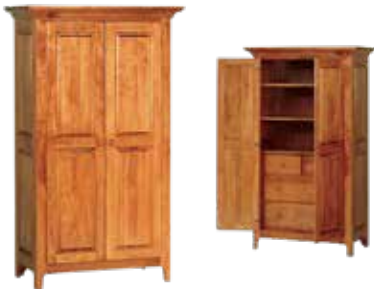
84-117 ARMOIRE -42" w x 72" h x 25" d