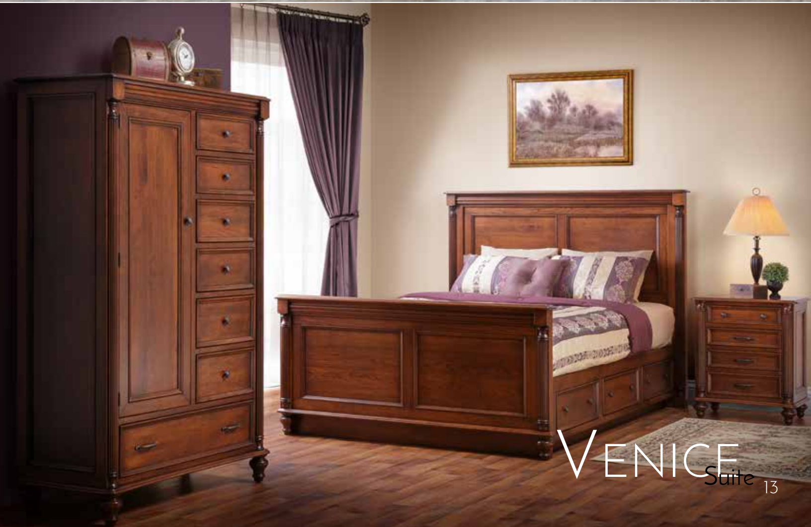
VENICE Suite 13