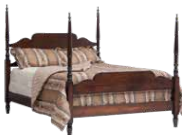
506 YORKTOWNE ARCH TOP BED -See Page 41