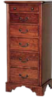
84-7413 LINGERIE CHEST -26" w x 54" h x 20" d