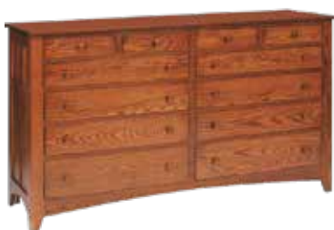
72-828 BACHELOR'S CHEST -78" w x 44" h x 20" d