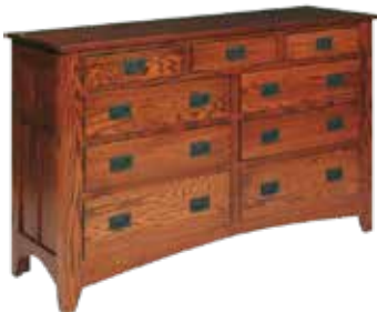
72-824 DOUBLE DRESSER -60" w x 37" h x 20" d