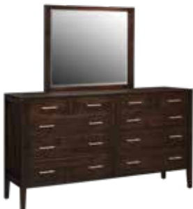
88-1426-70 TRIPLE DRESSER -70" w x 39" h x 19" d