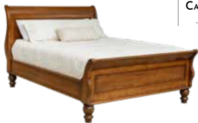
84-501 CANYON CREEK SLEIGH BED -53"h (head) 31"h (foot)