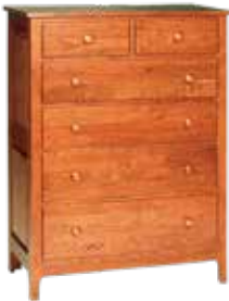
84-115 CHEST OF DRAWERS -36" w x 47" h x 20" d