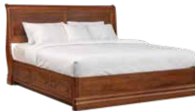
84-540-3 CALAIS SLEIGH BED -with underbed storage -50" h (head) 16" h (foot)