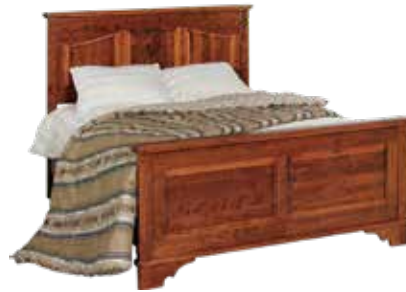
548 CONCORD BED -See Page 42