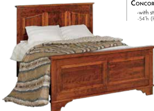
84-548 CONCORD BED -with standard side rails -54" h (head) 30" (foot)