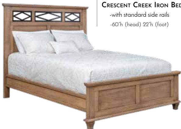
88-537 CRESCENT CREEK IRON BED -with standard side rails -60" h (head) 22" h (foot)