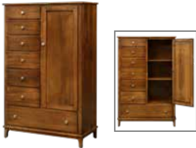
88-7816 DOOR AND DRAWER CHEST -42" w x 67" h x 20" d