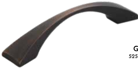
Glendale Pull 525-96 DBAC 4 5 / 16 " L

Available in BNBDL, DBAC, MB, NI, PC, SBZ, SN