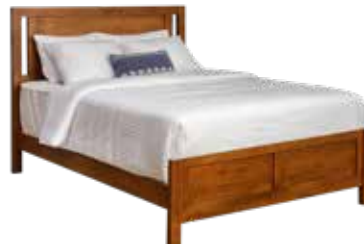
556 WESTLAKE PANEL BED -See Page 26