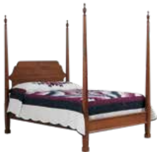
84-521 PENCIL POST BED -89" h (head) 89" (foot)