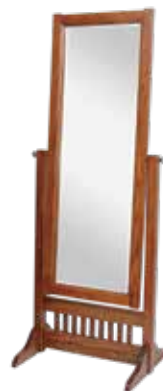
72-00710 MISSION CHEVAL MIRROR -29" w x 70" h x 22" d