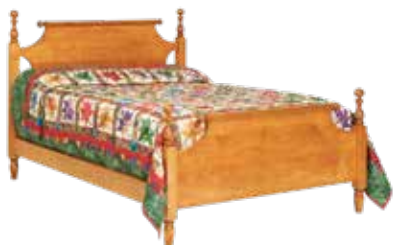
505 YORKTOWNE SCROLL BED -See Page 41