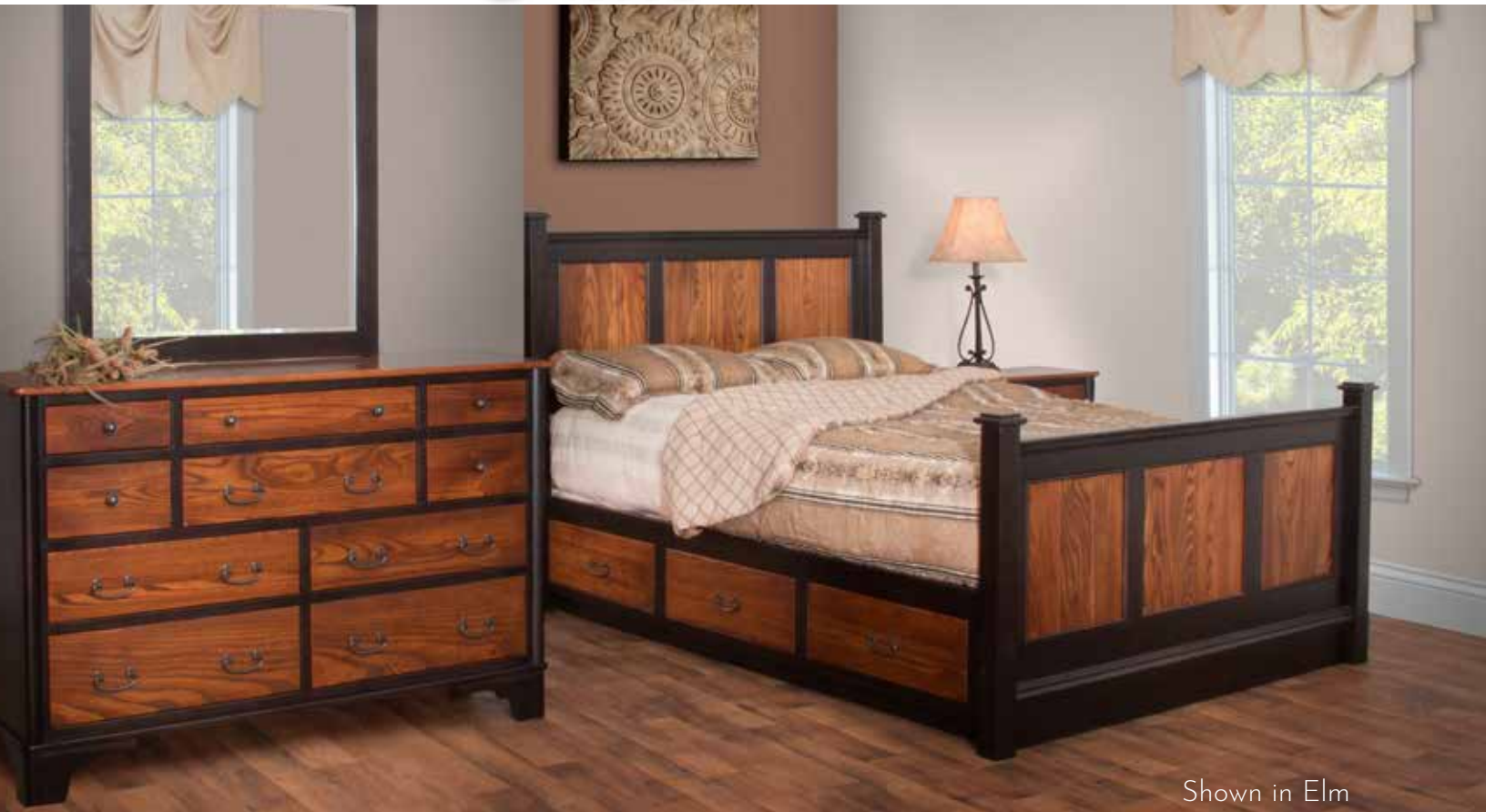
Shown in Elm