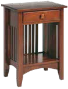
84-101 NIGHT TABLE -21" w x 27" h x 15" d